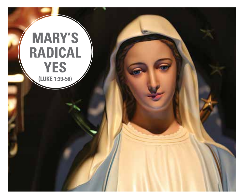
Statue of Virgin Mary, Our Lady of Grace